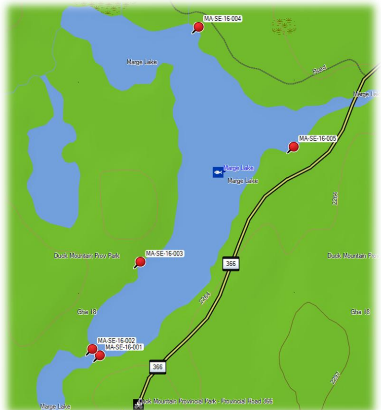
Figure 1: Marge Lake Seining Locations (2013 - 2017)

Background Info: Marge Lake has been a project lake for SVSFE and Fisheries Branch's since initial walleye introductions in 2010. SVSFE and Fisheries Branch have stocked adult and juvenile walleye via the Beautiful Walleye Transfer and initiated a catch and release regulation for walleye on the lake. Over the seven years, SVSFE has conducted surveys to monitor walleye populations, survival, growth rates, natural recruitment success, angling quality, including a spawn assessment on Marge Creek in the spring of 2014 (See FEF Project 13-063).