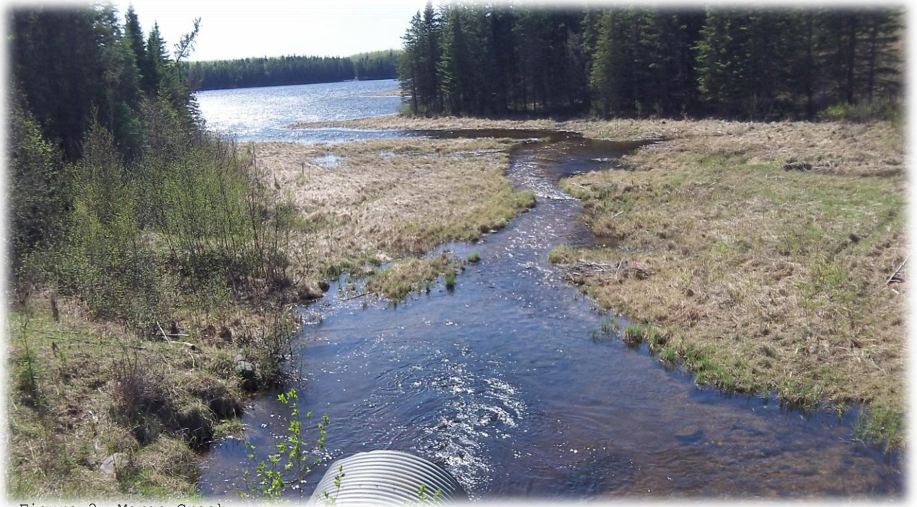
Figure 2: Marge Creek

Subject: Marge Lake Walleye Recruitment Surveys 2017